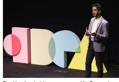
The Unmistakables were named in Campaign Magazine's list of Best Places to Work 2022