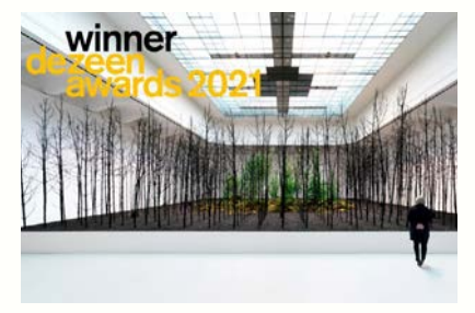
Superflux were announced as Design Studio of the Year at the Dezeen Awards