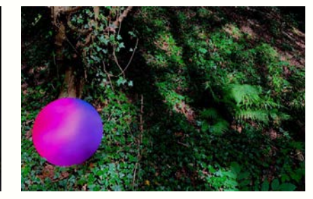
Lifescaped exhibited the Brightest colours ever to have been created at Kew Gardens