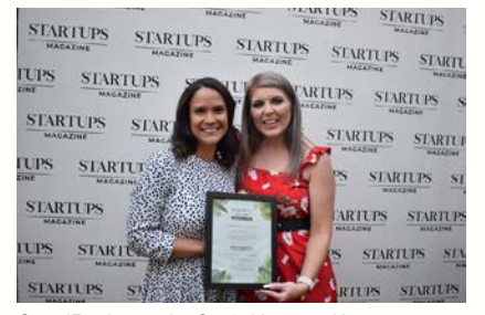
GoodFind won the Social Impact Hero category at the Hustle Awards