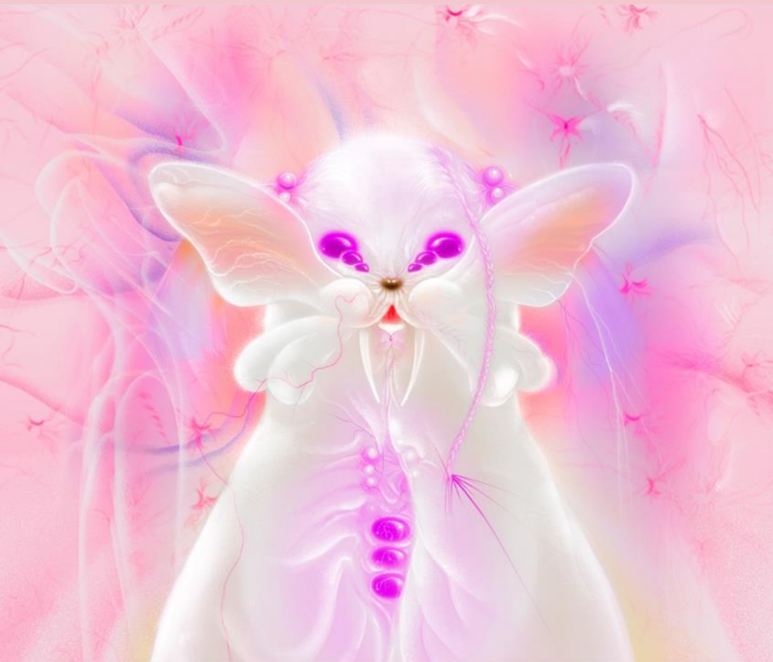
Ram Han Save our souls_02 (seal) , 2022