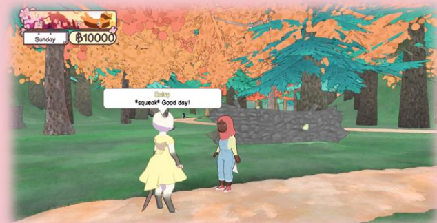
Calico - Peachy keen Games