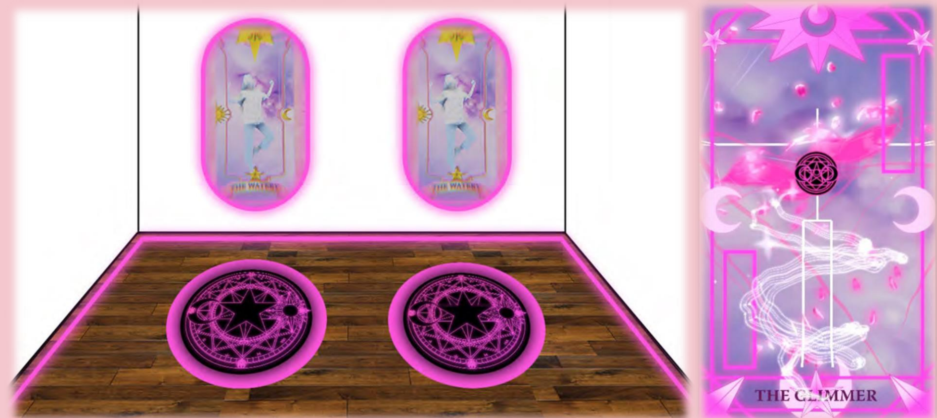
Renders by Sian Fan

This commission is inspired by the artist's experience growing up mixed heritage (Chinese/British) in the 90s, seeking out images of Asian identity via popular media and how the undeniably alluring, yet heavily mediated, imagery of 90s anime shaped her ideas of self, beauty and cultural identity. Visitors finds themselves crystalized in the liminal state of transformation, caught between normality and magic, between physical and digital, it encourages them to embody and consider the experience of the Asian female as a hyper-aestheticized form.