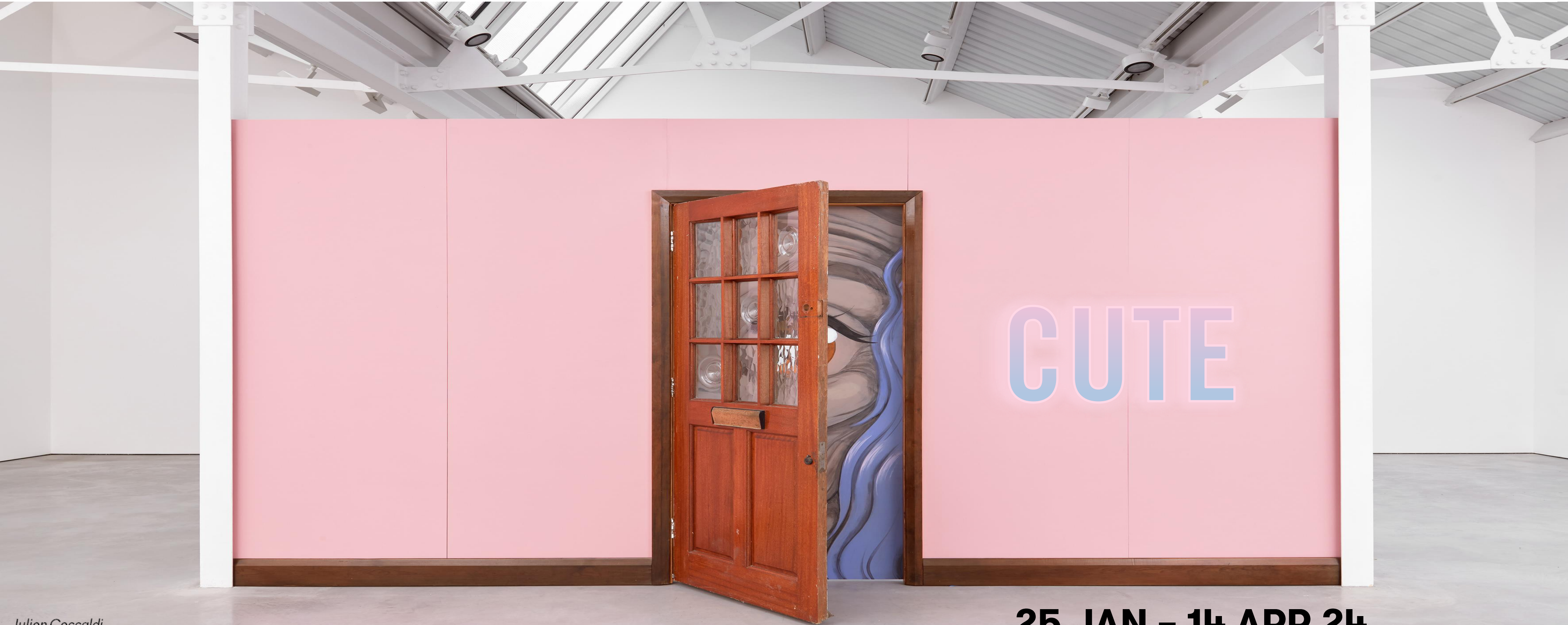
Julien Ceccaldi Door to Cockaigne, 2022