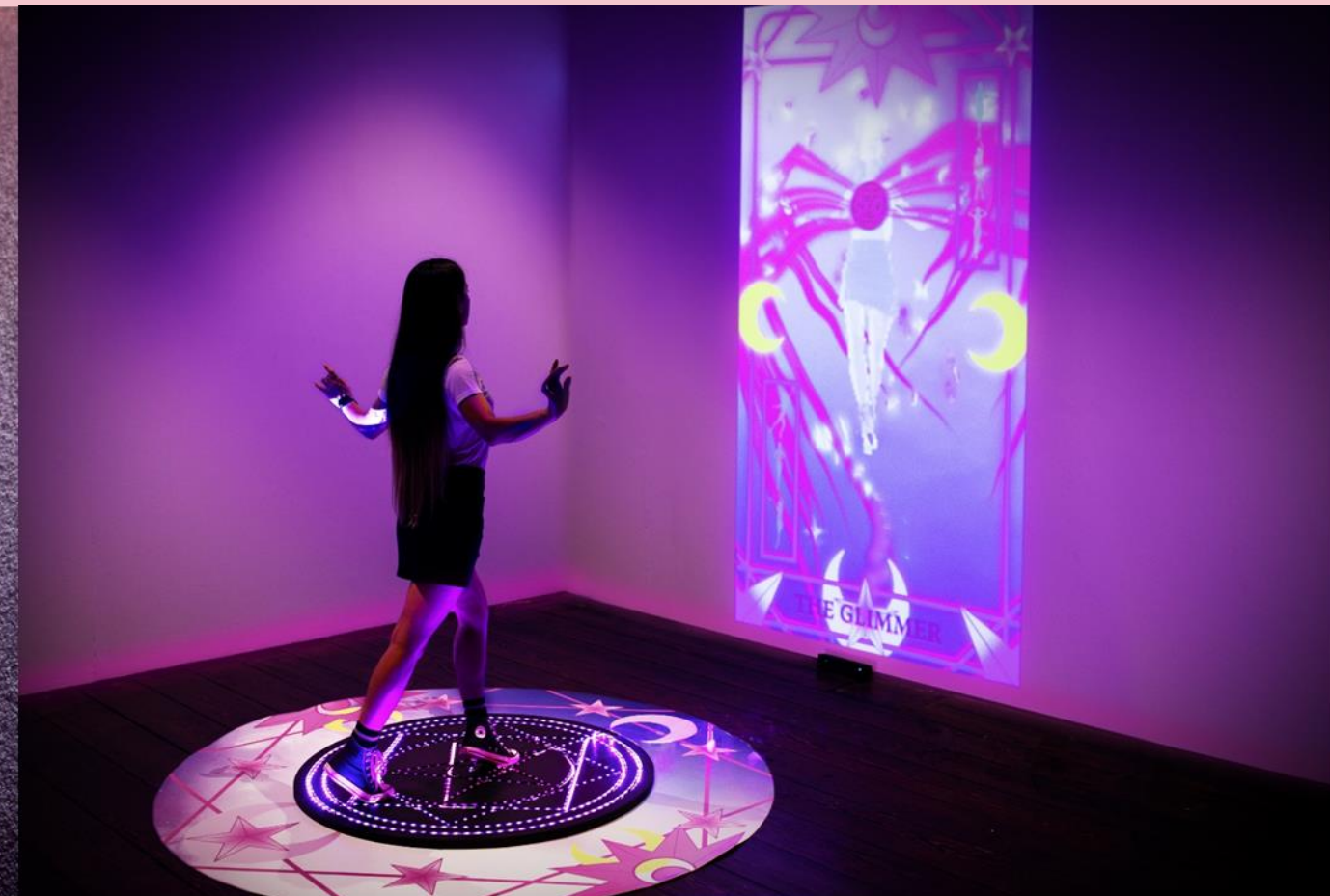
Sian Fan Glimmer , 2023 Courtesy of Artist. Commissioned by Somerset House Trust. Photo Alina Zum Hebel.