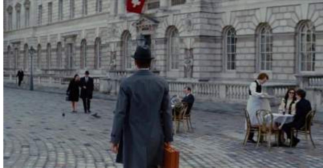
X-MEN: FIRST CLASS