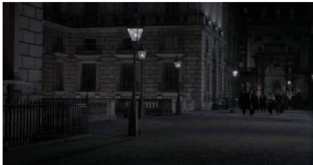
DANCING ON THE EDGE