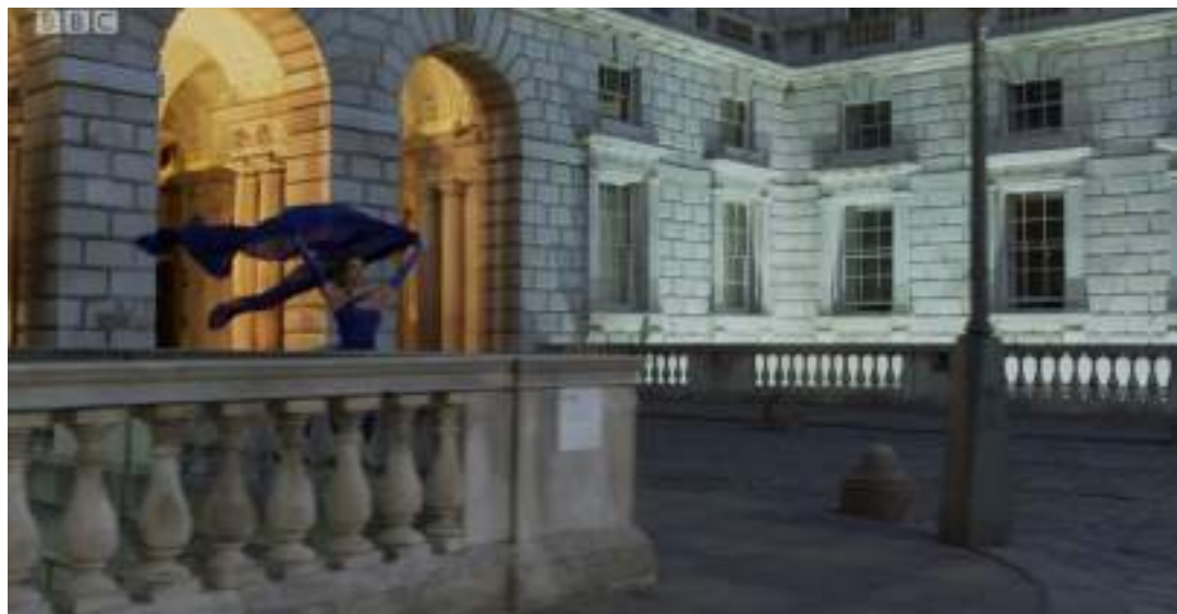
STRICTLY COME DANCING