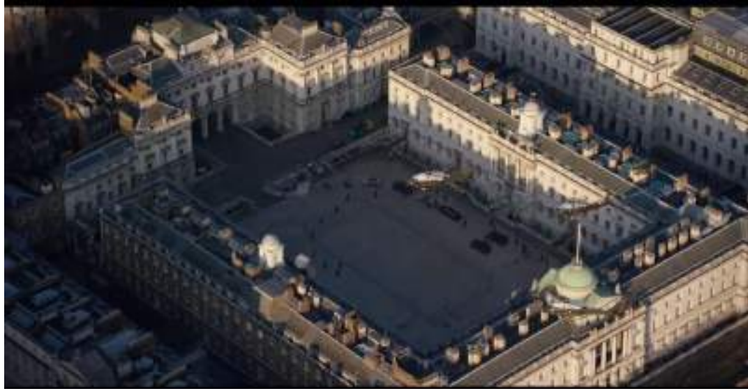
LONDON HAS FALLEN