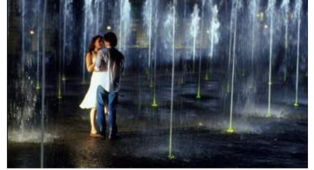
BRIDE & PREJUDICE