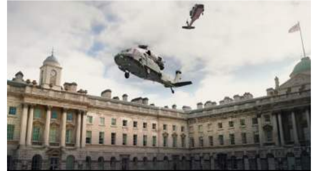
LONDON HAS FALLEN