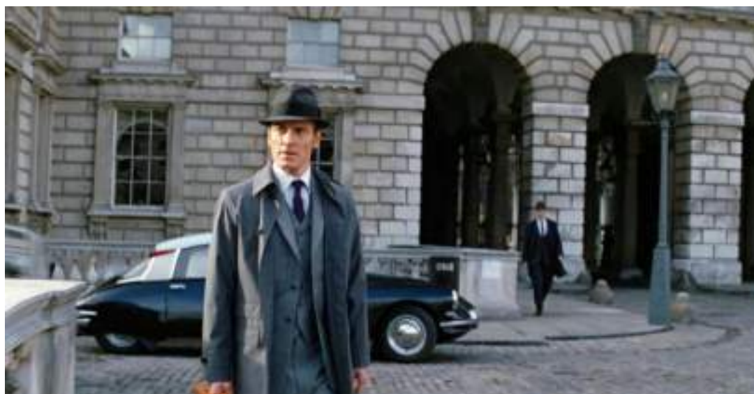
X-MEN: FIRST CLASS